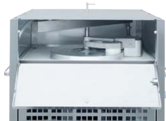
front lid open