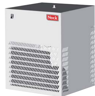
NSH 400 without stock container for ice