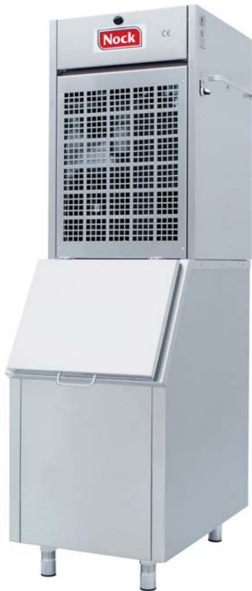
NSH 150 with stock container for ice NEV 100 (optional)